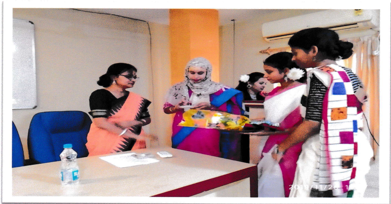
FELICITATION BY STUDENTS

Rmz Principal CHANDIDAS MAHAVIDYALAYA P.O.-Khujutipara Dist.-Birbhum