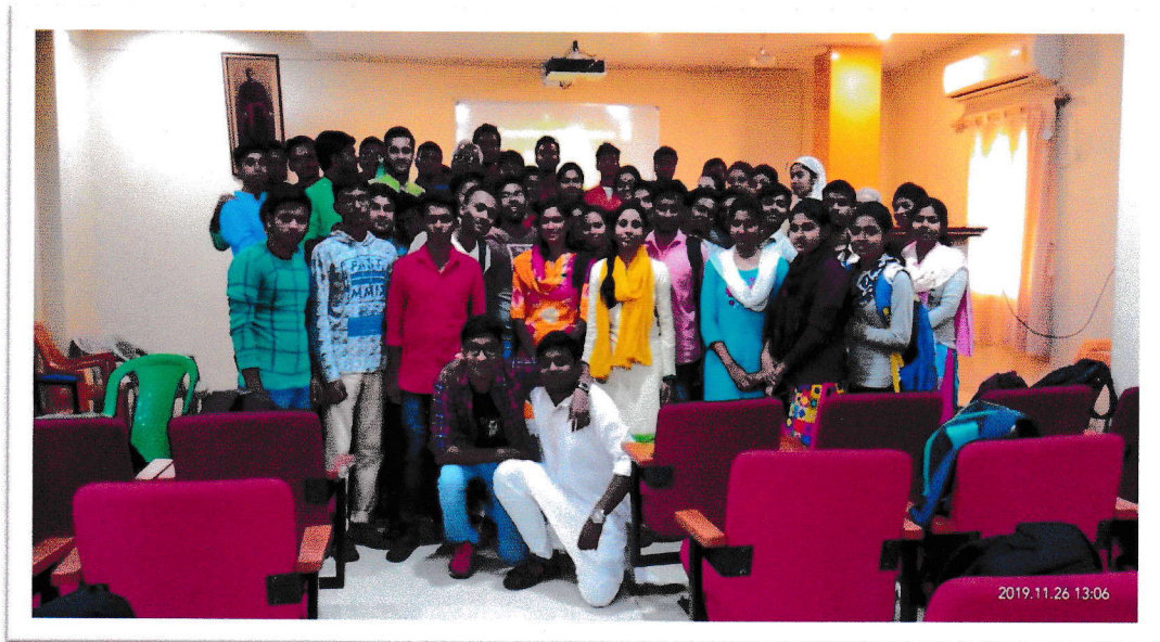
STUDENTS OF THE DEPARTMENT